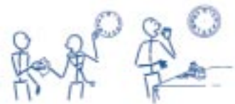
Take medicines on a schedule as directed by the doctor

understand medications and the treatment of chronic conditions. A pictograph is a picture that represents an idea. The goal of pictographs is to develop effective and efficient ways to communicate complex ideas to people who cannot read or who have limited reading skills. The results of an evaluation from the Pictograph Research Project show that pictographs combined with spoken explanations can increase information available to people for managing symptoms and problems related to complex illnesses.