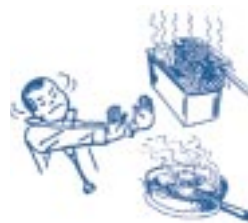
Don't eat fried foods

understand medications and the treatment of chronic conditions. A pictograph is a picture that represents an idea. The goal of pictographs is to develop effective and efficient ways to communicate complex ideas to people who cannot read or who have limited reading skills. The results of an evaluation from the Pictograph Research Project show that pictographs combined with spoken explanations can increase information available to people for managing symptoms and problems related to complex illnesses.